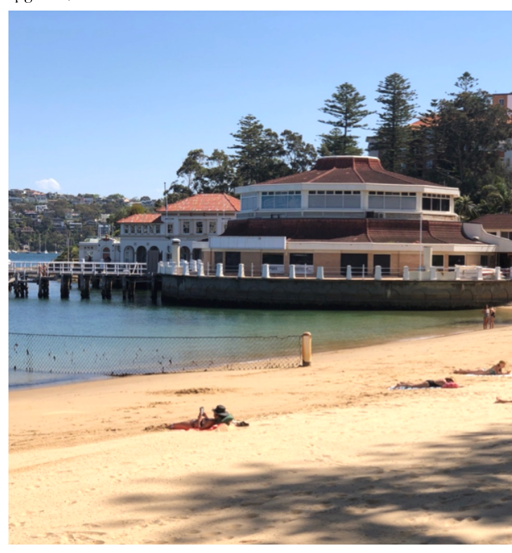
For more information on Wharf 3 and the aquarium site visit https://roads-waterways.transport.nsw.gov.au/projects/manlywharf-3-upgrade/index.html

For more on Wharf 3 and the aquarium site visit https://roads-waterways.transport.nsw.gov.au/projects/manly-wharf-3-upgrade/index.html